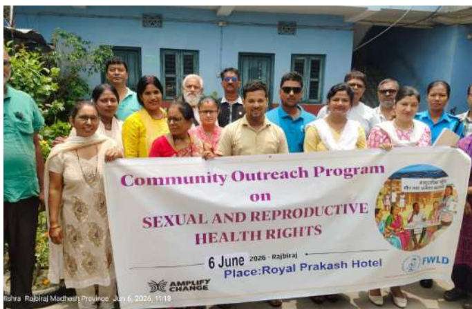
◀ Date : June 6, 2026 Venue : Rajbiraj, Madhesh Province