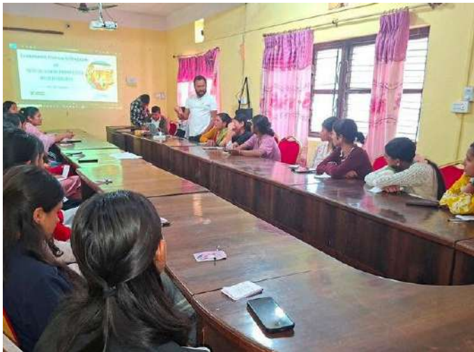
Date : May 3, 2026 Venue : Dailekh, Karnali Province