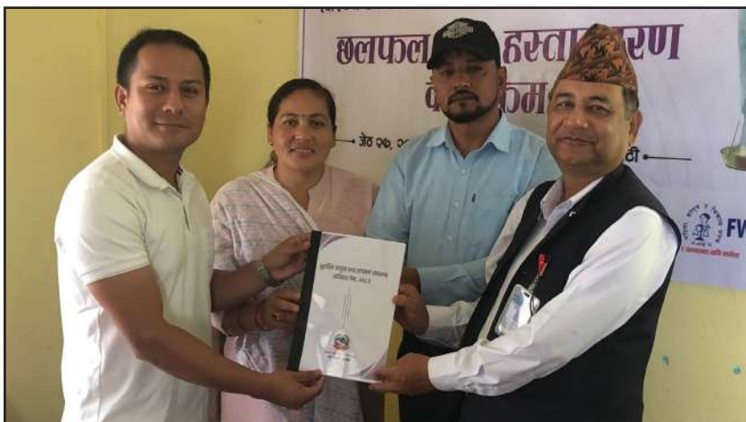
◀ Date : June 10, 2026 Municipality : Dipayal Silgadhi Municipality, Doti