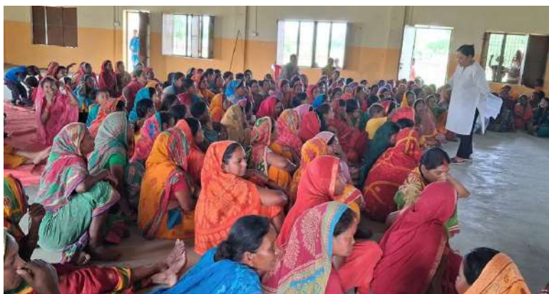
Date : May 5, 2026 Municipality : Jirabhawani Rural Municipality and Pokhariya Municipality, Parsa, Madhesh Province