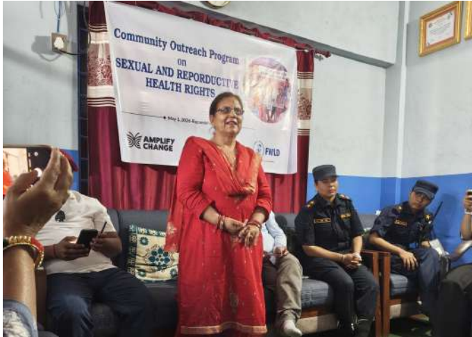
Date : May 1, 2026 Venue : Rupandehi, Lumbini Province

with the legal support available in the event of rights violations. The event saw participation of community members, ward members, police personnel, and representative from OCMC, health institutions and the media.