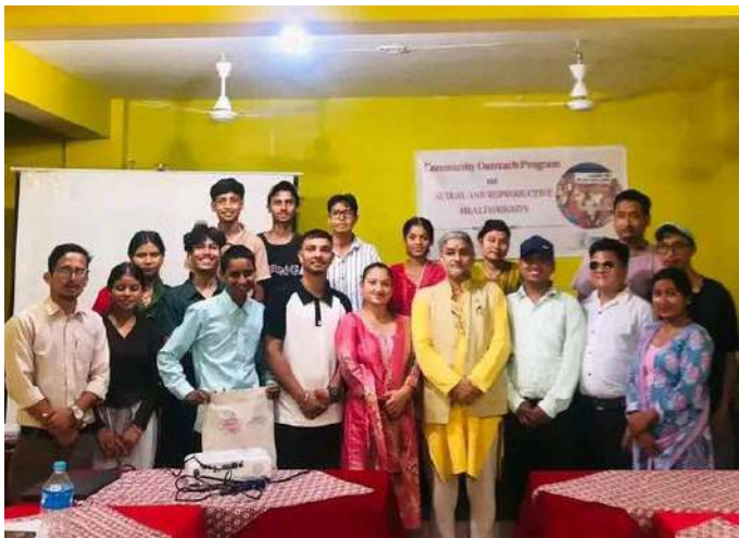
Date : May 21, 2026 Venue : Kailali, Sudurpaschim Province