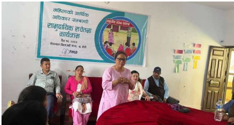
Date : April 2, 2026 Municipality : Silgadhi, Ward No. 6 – Dipayal Silgadhi Municipality, Doti, Sudurpaschhim Province

of their rights, limiting their ability to access and benefit from economic opportunities and resources. The programs were therefore designed to enhance awareness of women's economic rights and strengthen women's capacity to exercise, claim, and protect those rights with confidence.