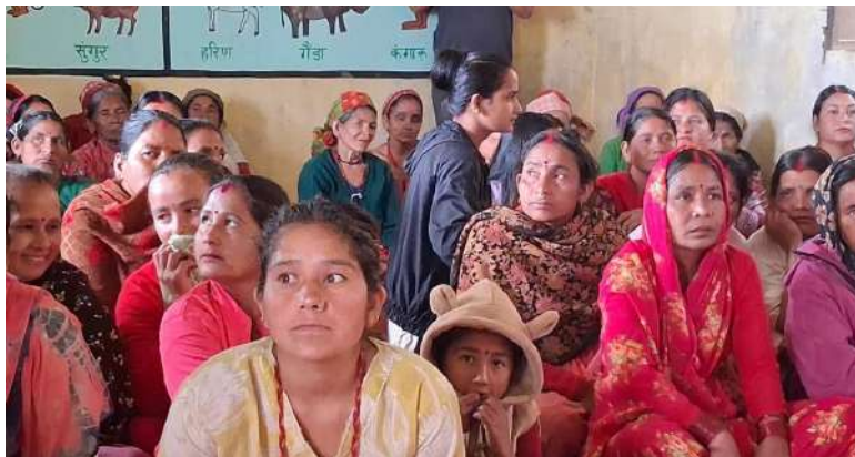
Date : April 6, 2026 Municipality : Silgadhi, Ward No. 7 – Dipayal Silgadhi Municipality, Doti, Sudurpaschhim Province