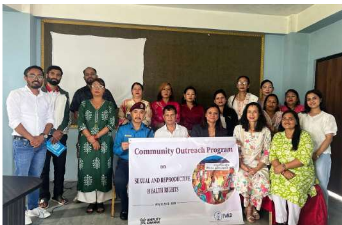
◀ Date : May 31, 2026 Venue : Ilam, Koshi Province