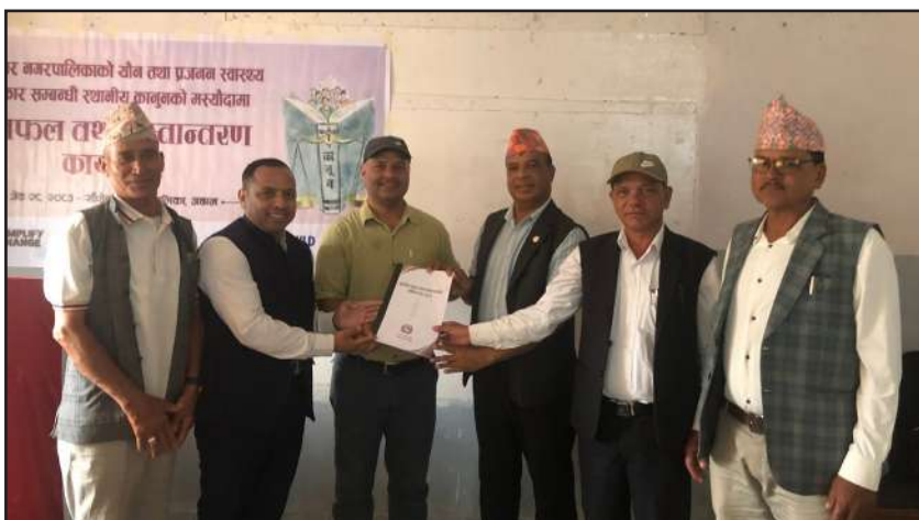
◀ Date : June 11, 2026 Municipality : Sanfegar Municipality, Accham