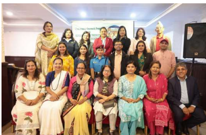
◀ Date : June 11, 2026 Venue : Pokhara, Gandaki Province