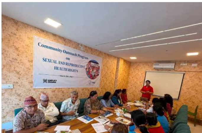
◀ Date : May 26, 2026 Venue : Jhapa, Koshi Province