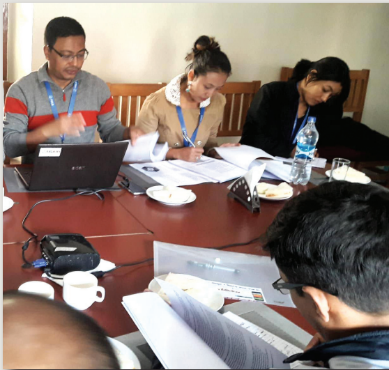
Sharing and consultation meeting with DoCR on the findings of Legal Analysis of the Civil Registration Laws of Nepal on Nov 14, 2017.